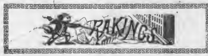
A MAN OF PRINCIPALS.

The Democratic party has made martyrs of CALEB POWERS and W. S. TAYLOR, and millions of honest men in your party throughout the United States stand mortified at the spectacle that old Kentucky presents in imprisoning a fellow-citizen "four years on a murder charge without giving him the right of a free and fair trial before a Jury of his peers."